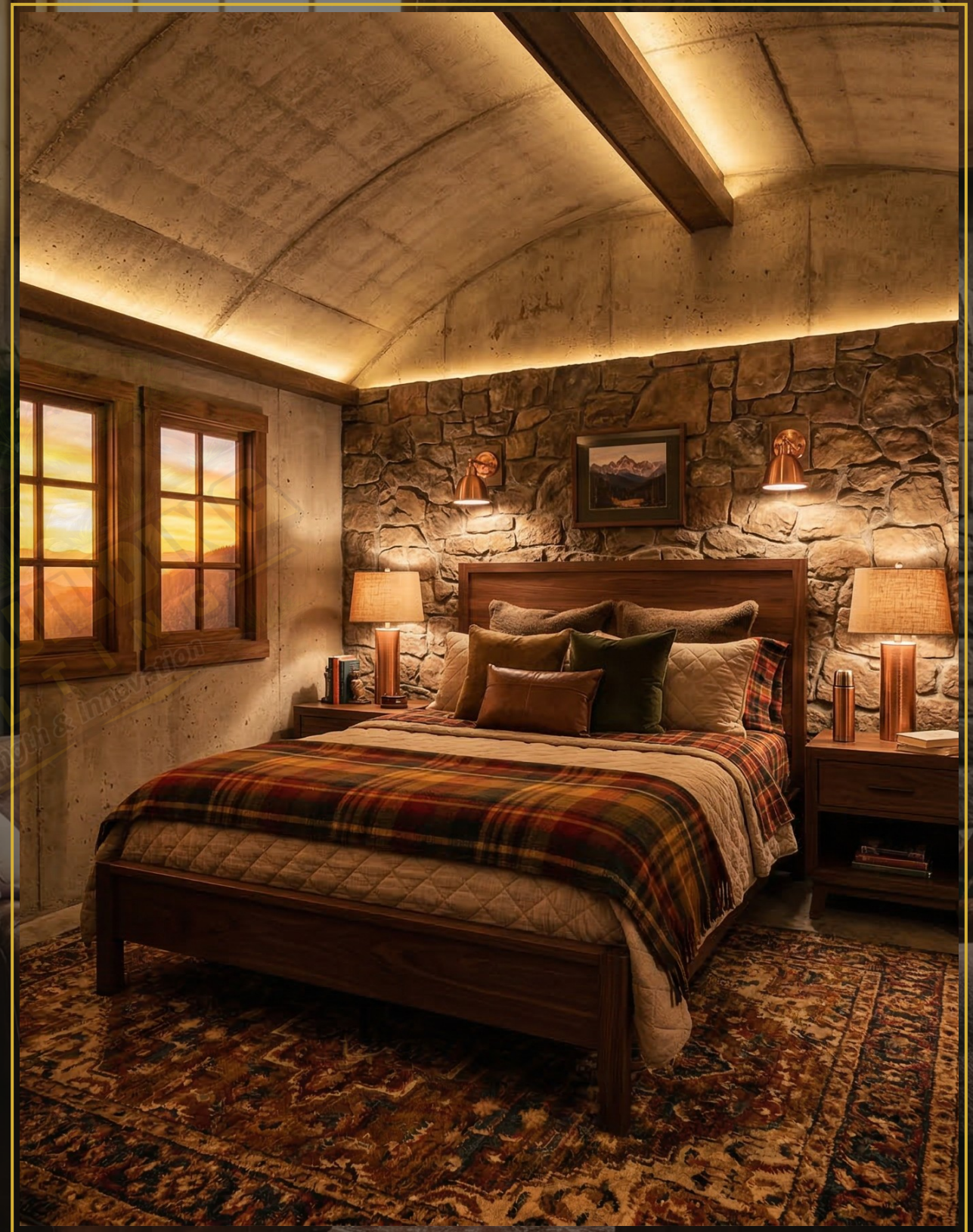
Master Suite • Underground Comfort